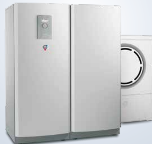
Atria Duo Optimum

The Thermia Atria Duo Optimum is a good choice if you have a low ceiling height or require very large amounts of hot water.